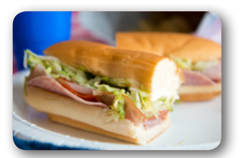
Italian Hoagies Ham, Capicola, Genoa Salami, Provolone Cheese, Lettuce, Tomato, Onion, Peppers, & Oil and Vinegar, on Martin's Hoagie Rolls Get the recipe at: potatorolls.com